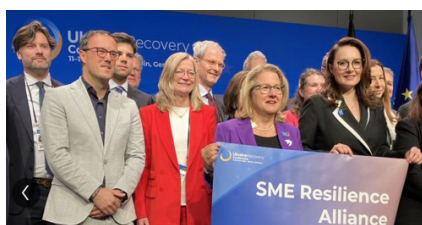
BIO joined the Ukraine Recovery conference in Rome in July 2025, making a first commitment to invest in the country

"Ukraine is standing firm in the face of Russia's brutal aggression. It deserves more than our admiration. It deserves our lasting commitment. Supporting Ukraine today means refusing to let a European country be crushed by violence. It means affirming that only a just peace, based on law and sovereignty, is acceptable." - Maxime Prévot, Vice Prime Minister and Minister of Foreign Affairs, European Affairs and International Cooperation